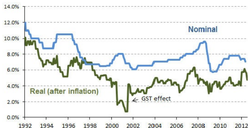
Figure 2 Bank standard housing rates

Low interest rates, particularly when they occur at the same time as low inflation, encourage borrowing. After all, that's their intention, but the economic orthodoxy is that such borrowing should be for productive investment. That orthodoxy was developed in a period of moderate inflation, and before banks were so willing to extend credit through instruments such as mortgage redraw.